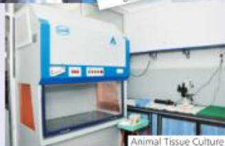
Animal Tissue Culture