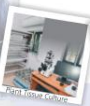
Plant Tissue Culture